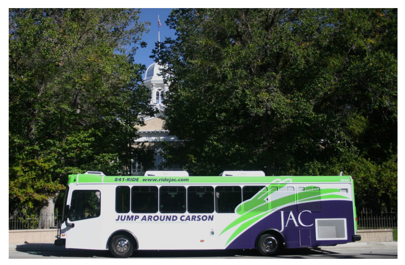
New buses acquired in 2016 have a longer service life, serve customers better, and are more fuel efficient.